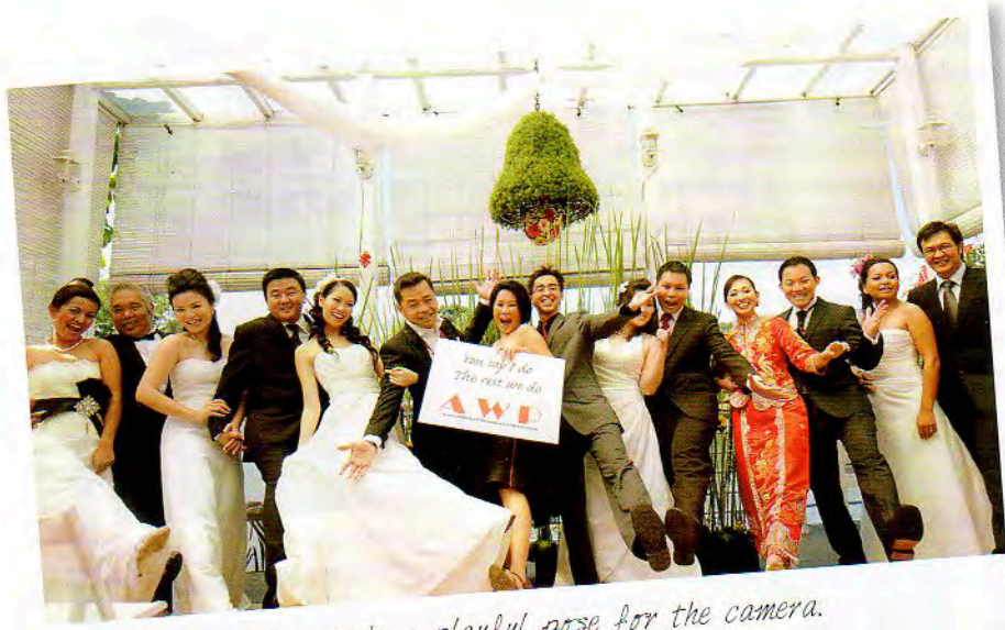
Couples strike a playful pose for the camera.