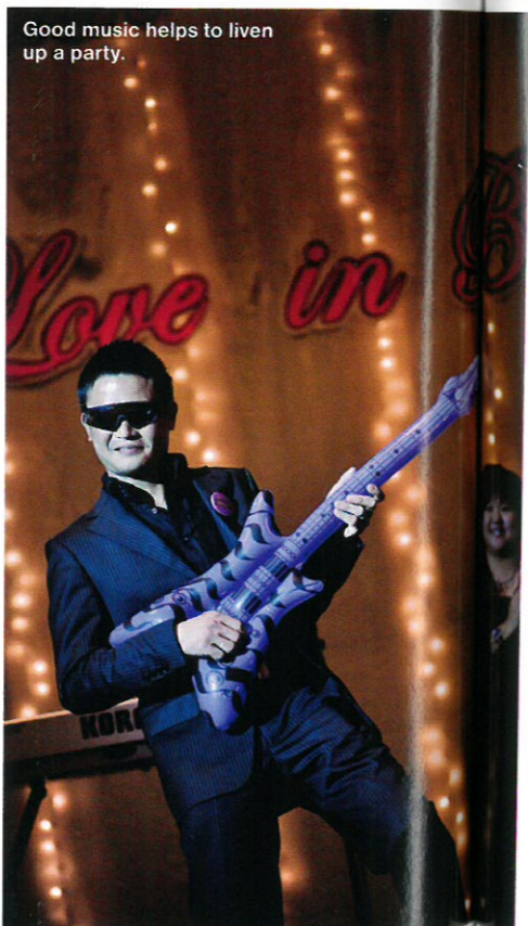
Good music helps to liven up a party.