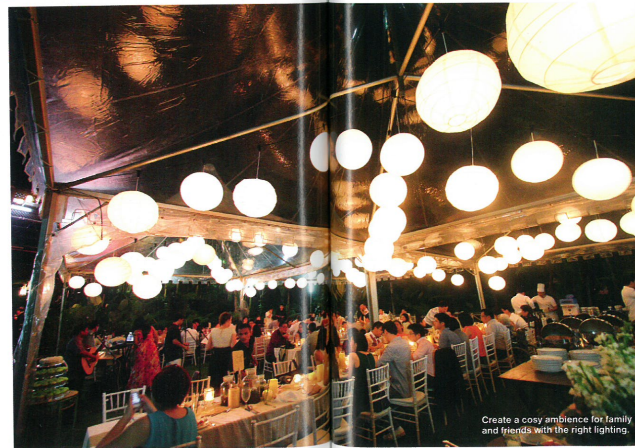
Create a cosy ambience for family and friends with the right lighting.