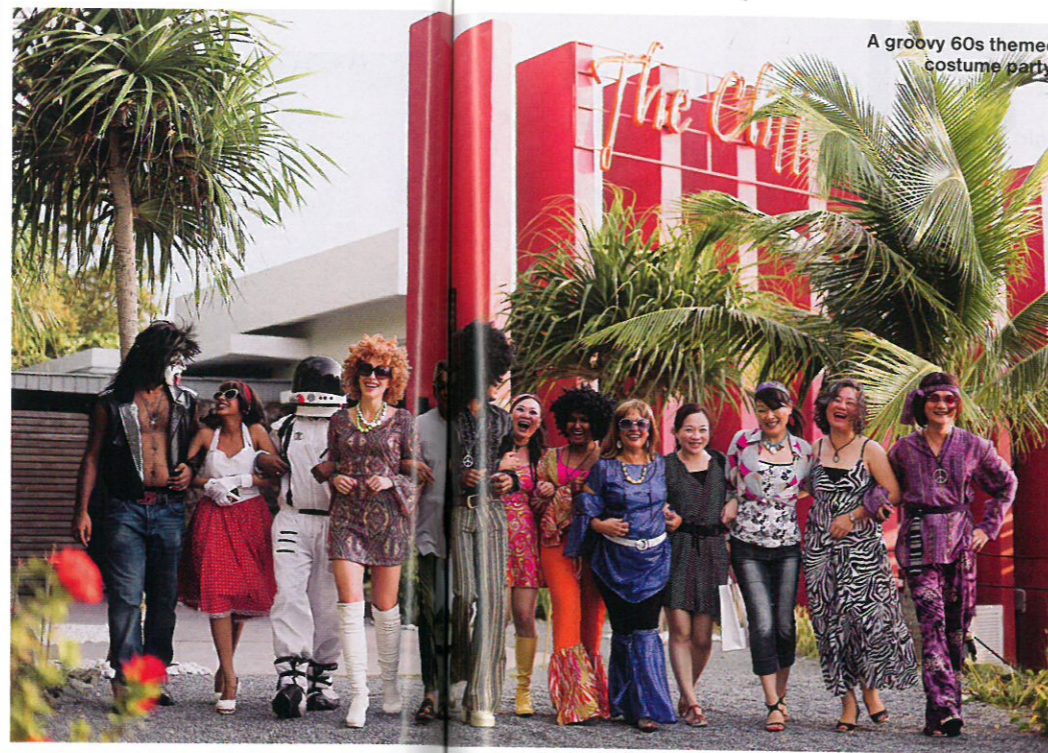
A groovy 60s themed costume party.