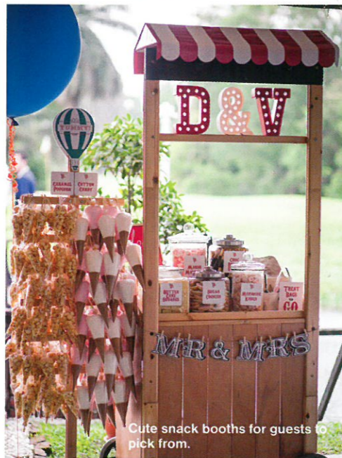
Cute snack booths for guests to pick from.