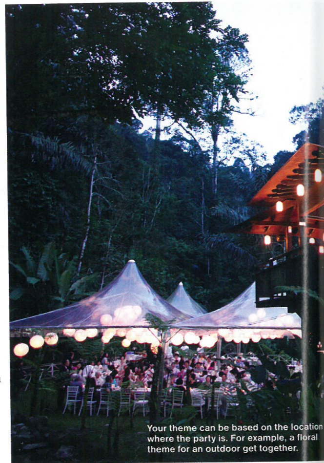
Your theme can be based on the location where the party is. For example, a floral theme for an outdoor get together.

"Having a theme is nice especially in our Instagram age, but not crucial. You don't have to colour coordinate to have fun! A theme can be as simple as a colour palette or as adventurous as a costume party, so it depends on the type of guests you are inviting (whether