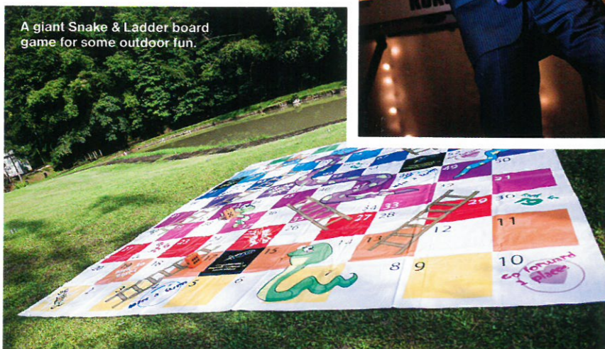
A giant Snake & Ladder board game for some outdoor fun.