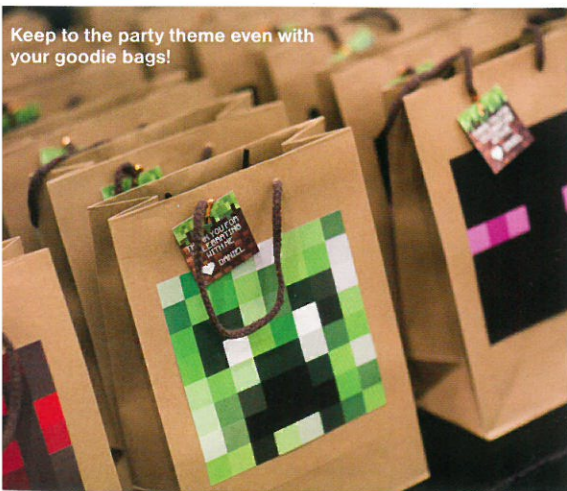
Keep to the party theme even with your goodie bags!