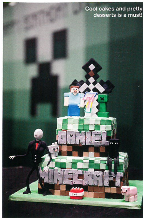
Cool cakes and pretty desserts is a must!

Planning can really take the wind out of you, so try to take some downtime just before the big day to relax. It's important that you don't get too caught up in the preparation and burn out during the party. W