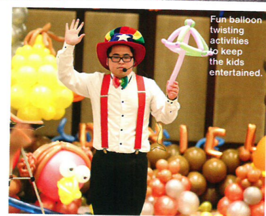
Fun balloon twisting activities to keep the kids entertained.