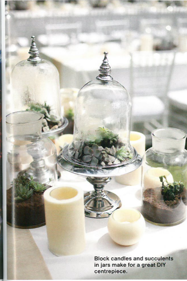
Block candles and succulents in jars make for a great DIY centrepiece.